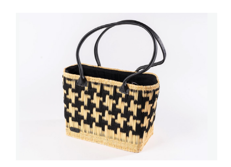
THALIA/ H015 WICKER