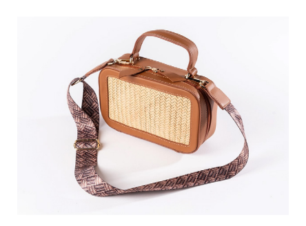
ELÉA/ H008 PALM LEAF + LEATHER