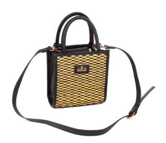
LYRA/ H005 WICKER + LEATHER