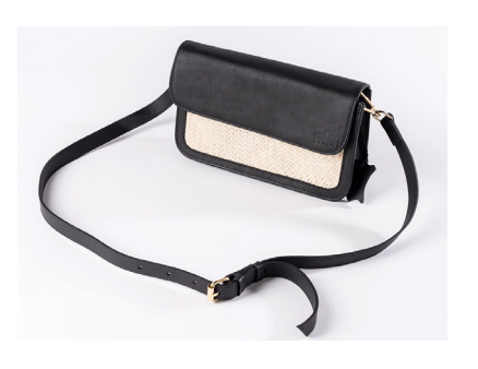
ISDORA/ H009 PALM LEAF + LEATHER