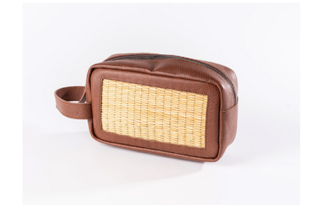
ARTISO/ H014 WICKER + LEATHER