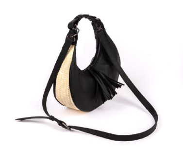
VESPERA/ H004 PALM LEAF + LEATHER