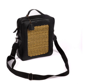
NOVA/ H011 WICKER + LEATHER