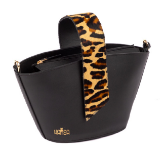
BLACK/ H007 LEATHER