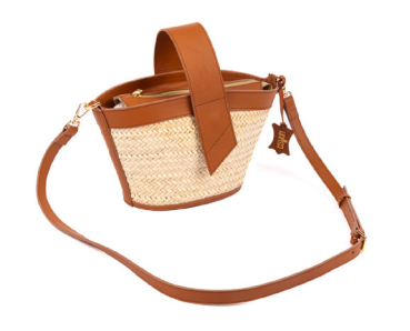
AURÉLIA/ H001 PALM LEAF + LEATHER