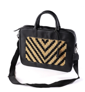
URBAIN-EDGE WICKER + LEATHER