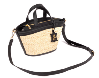
MELINA/ H002 PALM LEAF + LEATHER