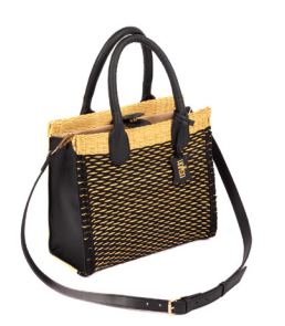
LUNARA/ H010 WICKER + LEATHER